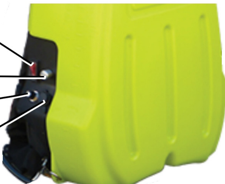
Figure 3 – WeedMasta Controls