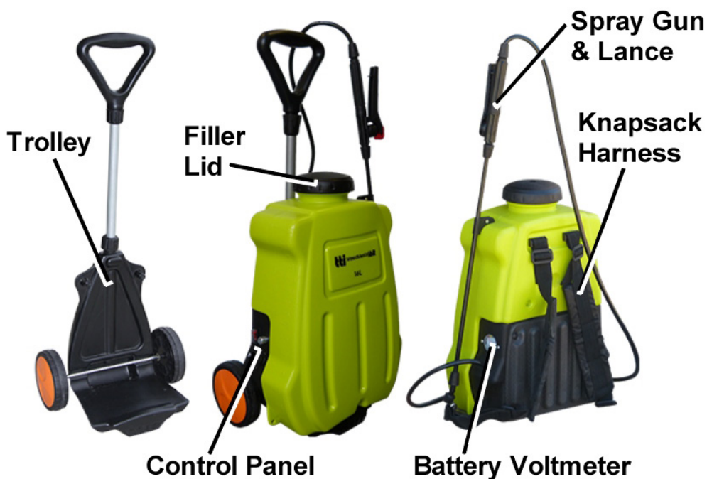
Figure 1 – Component Identification

The TTi WeedMasta Rechargeable Sprayer is designed to carry and distribute herbicides or pesticides using a self-contained pump and spray gun. The WeedMasta has the features shown in Figure 1